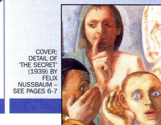
COVER: DETAIL OF THE SECRET (1939) BY FELIX NUSSBAUM - SEE PAGES 6-7

The European MagAZine, 200 Gray's Inn Road, London WC1X 8NE, UK. tel: +44 (0)171-4187777 fax: (0)171-7131870 e-mail: 74431.1416@compuserve.com